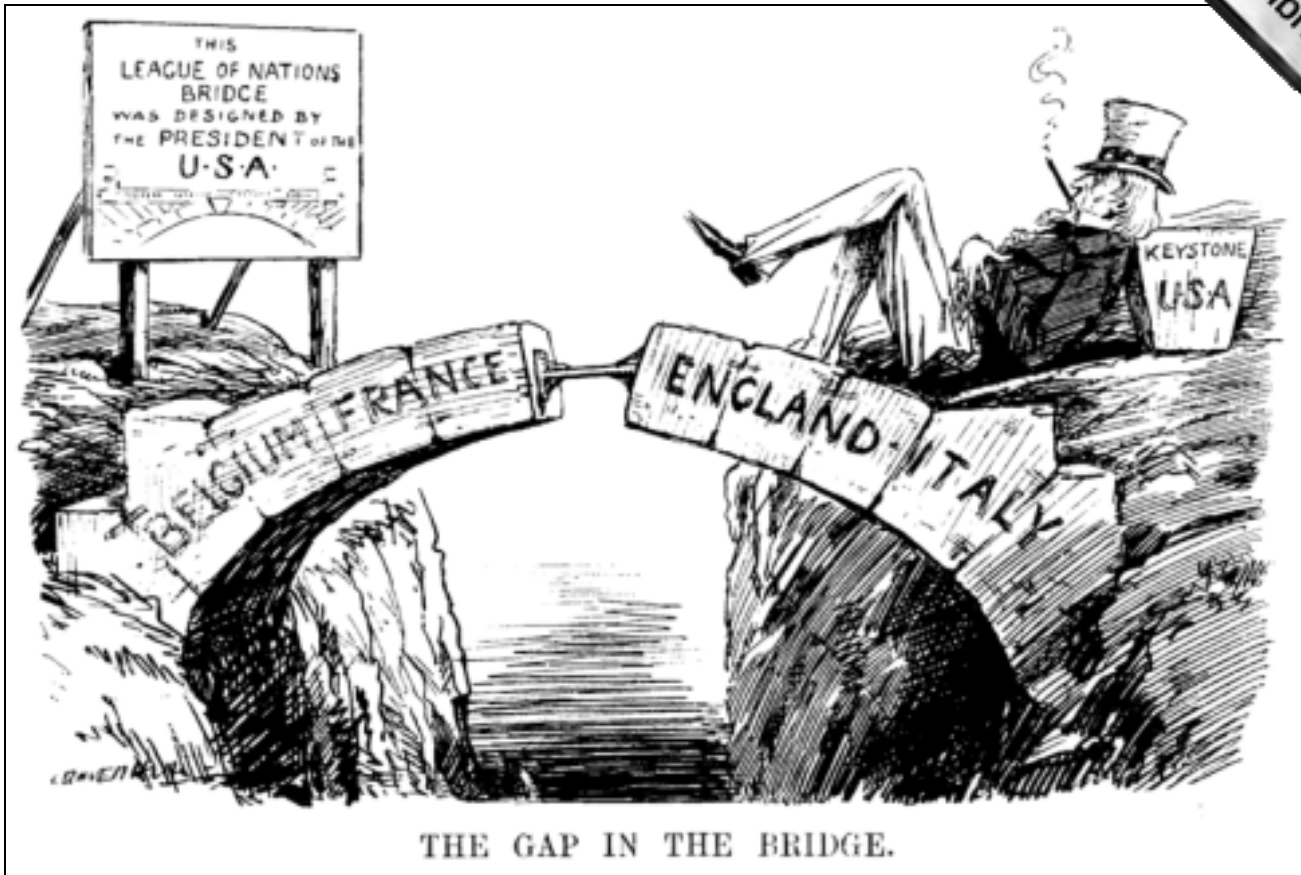
A cartoon from the British magazine 'Punch', December 1919.

Answer both parts of the question with reference to the sources.